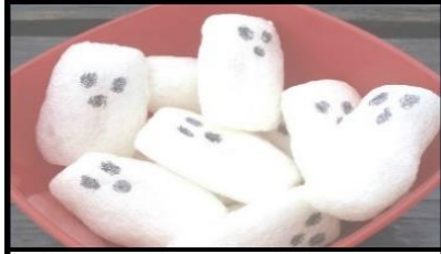
Vanishing Ghosts simple STEM for Halloween